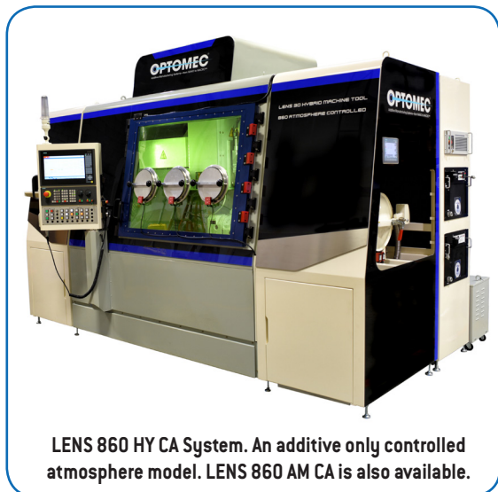
LENS 860 HY CA System. An additive only controlled atmosphere model. LENS 860 AM CA is also available.

Larger Work Envelope & Higher Power Bring More Capabilities for Affordable, High Quality Metal Hybrid Manufacturing.